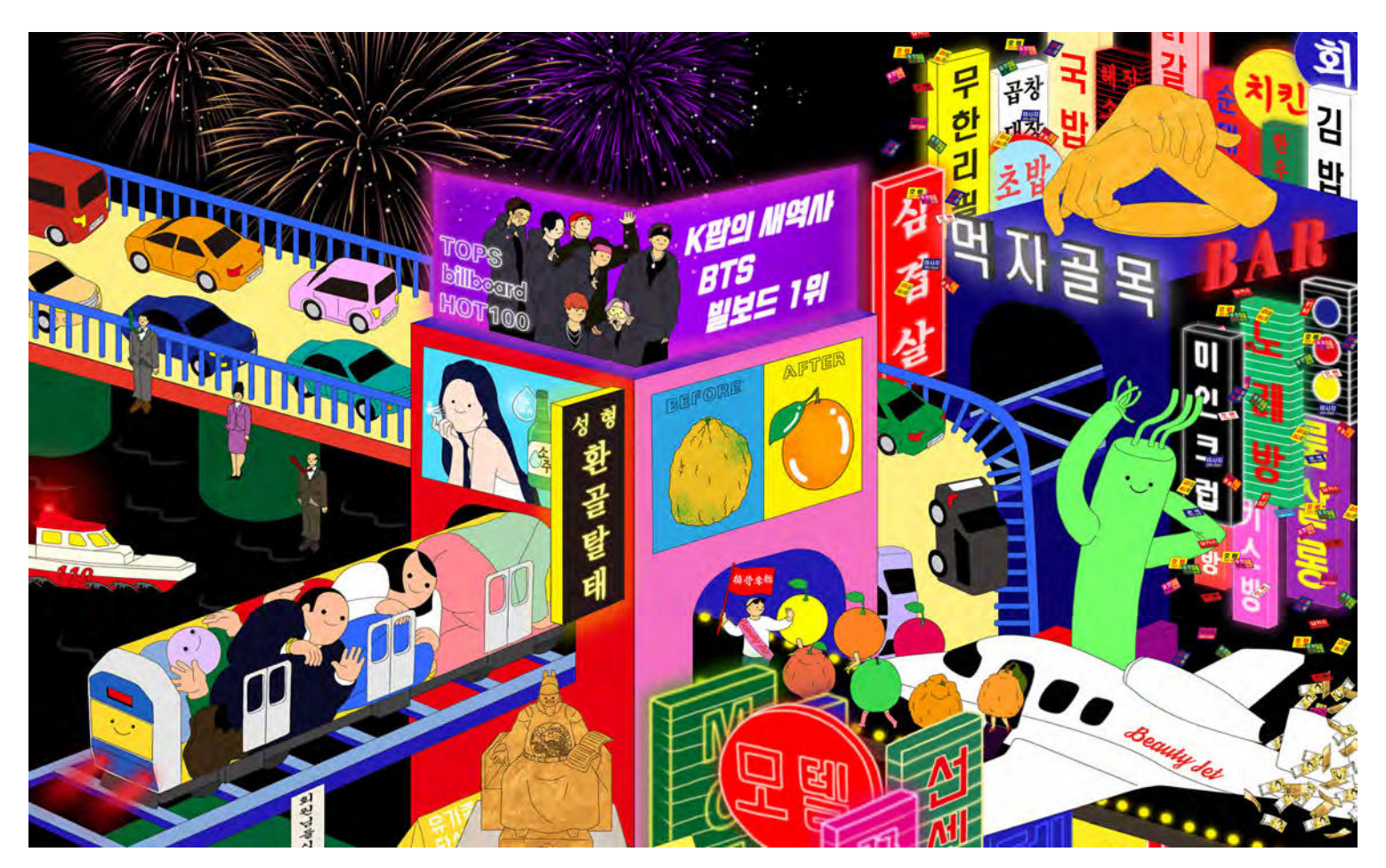
K-Pop, K-Beauty the K-Wave is fiercely trending nowadays. But beyond this glamour, Korean people are suffering in the society of South Korea. You are wild about K-Wave, we are burning in Hell-Chosun.

My Korea is comedy when seen in long-shot, but a tragedyin closeup.